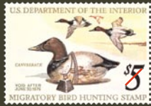
Canvasback Duck (decoy)