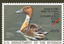
Fulvous Whistling Duck