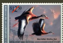
Black-bellied Whistling Ducks